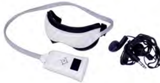
Eye massager goggles