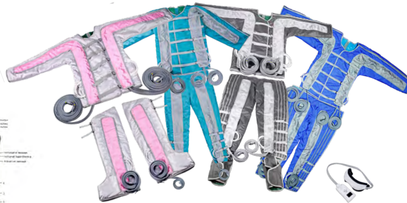
Alternative colours available