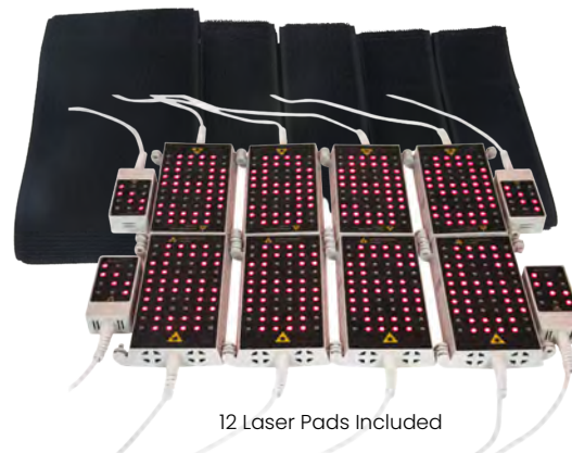
12 Laser Pads Included